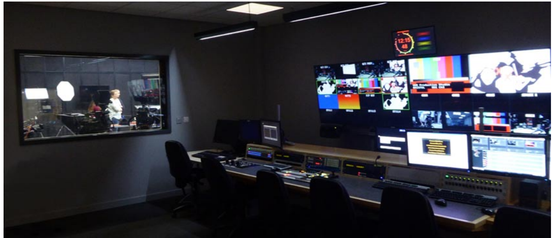
Image above shows production control gallery looking left towards one of the training studios and (below) right towards the audio control suite.

Active in Europe, Asia, Africa and the Middle East, ATG Danmon is part of the Dan Technologies Group which operates from offices in the United Kingdom, Germany, Denmark, Norway, Portugal, Spain, Sweden, the United Arab Emirates and Vietnam.